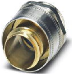
Cable gland made from brass with metric thread, rotatable, IP40 protection

Please be informed that the data shown in this PDF Document is generated from our Online Catalog. Please find the complete data in the user's documentation. Our General Terms of Use for Downloads are valid ( http://phoenixcontact.com/download )