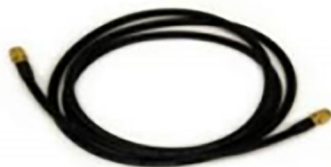
6: Optional-SMA-to-MMCX Device Cable