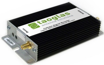
1: CSB.01 Amplifier Unit