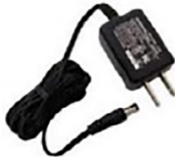
2: AC/DC Power Adaptor